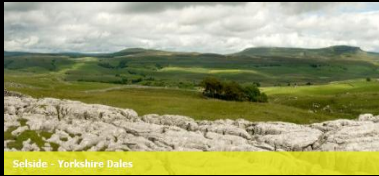
Selside - Yorkshire Dales