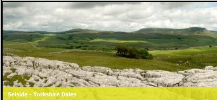
Selside - Yorkshire Dales